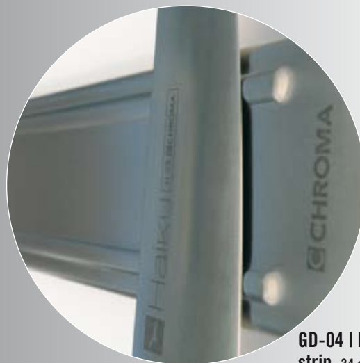
GD-04 | Magnetic strip, 34 cm

So far, the line consists of the GD-01 poultry and kitchen shears, the GD-02 cooking tongs, the GD-03 fishbone tongs and the GD-04 stainless steel magnetic strip.