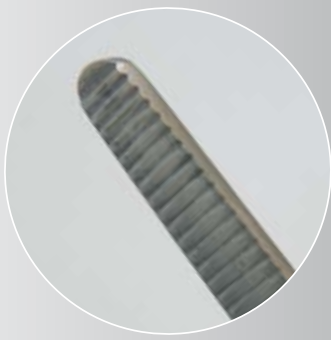
GD-01 | Kitchen and poultry shears, 22,5 cm

Dozens of uses come to mind for the GD-02 CHROMA kitchen tongs. Classic applications include turning over food that is cooking in the frying-pan, and sorting and decorating fine foods on the plate with pinpoint accuracy.