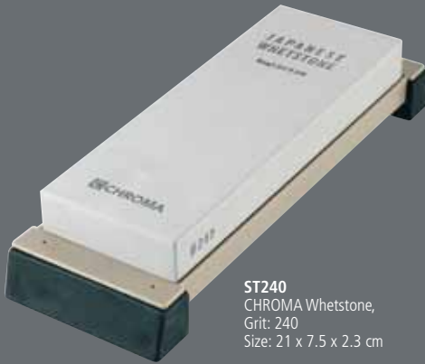
ST240 CHROMA Whetstone, Grit: 240 Size: 21 x 7.5 x 2.3 cm