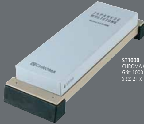
ST1000 CHROMA Whetstone, Grit: 1000 Size: 21 x 7.5 x 2.3 cm